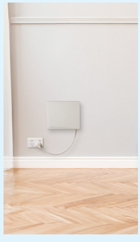
nbn connection box mounted on the inside surface of an external wall