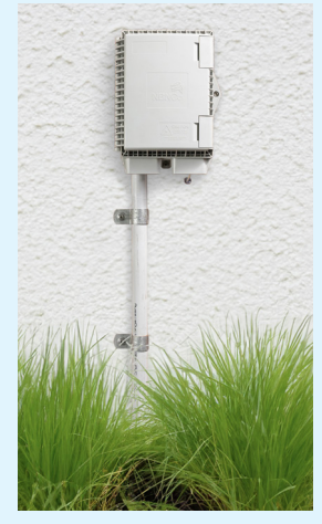
nbn utility box mounted on the surface of an external wall